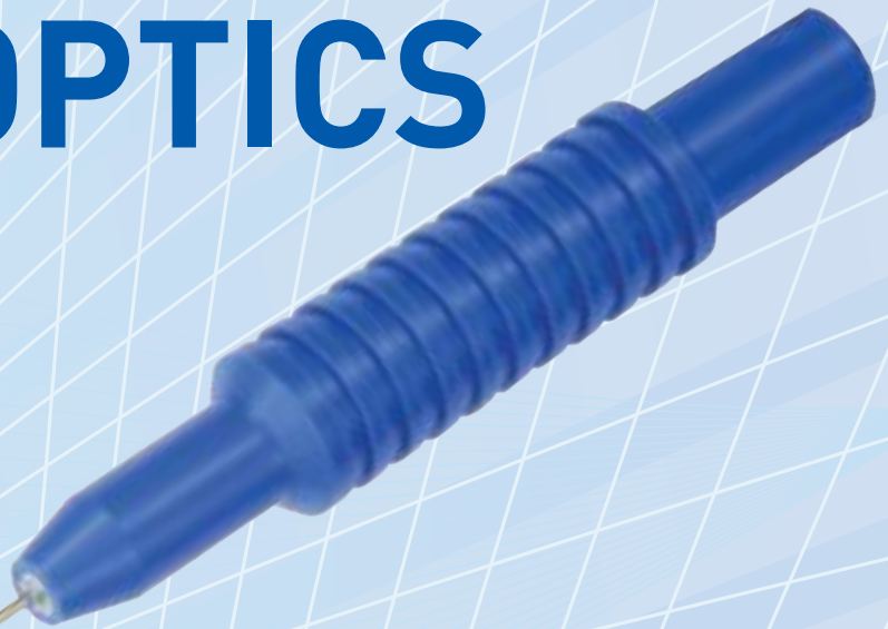
Standard Fiber Optic Probe